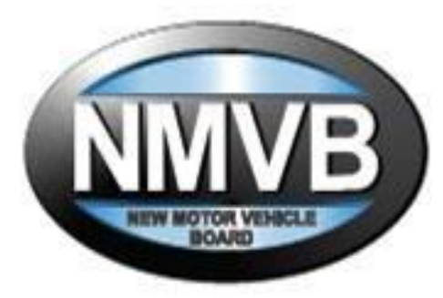
Option 1 – The logo displayed above was designed by DMV and used as the 2021 and 2022 NMVB Industry Round table event logo.

The current NMVB logo, displayed at the top of this memo, was adopted by the Board in 2007. The Administration Committee requested that staff propose options to update this logo. NMVB typically relies upon the services of Department of Motor Vehicles (DMV) graphic artists, as we did for the roundtable-specific logo utilized at the 2021 and 2022 Industry Round Table events. Staff requested that DMV design additional options to present to the Board for consideration of replacement of the NMVB logo. Below you will find several proposed options: